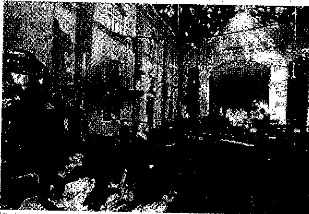
Sri Lankan terrori-iskut kohdistuivat mm. kirkkoihin, ja hotelleihin. Maan muslimiväestö säästyi terrorilta tyystin.

kolme poliisia kuoli, kun he olivat tekemässä kotietsintää terroristien epäiltyyn piilopaikkaan Colombon esikaupungissa ja asukkaat laukaisivat räjähteet välttääkseen pidätyksen. Iskuista kuusi ensimmäistä oli itsemurhapommituksia. – Emme usko, että näitä iskuja toteutti tämän maan sisälle rajoittuva ryhmä, hallituksen tiedottaja Rajitha Senaratne sanoi. Sri Lankan presi-