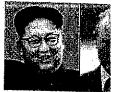
Kim Jong-Un ja Vladimir Putin selvittävät maiden välistä kauppaa.